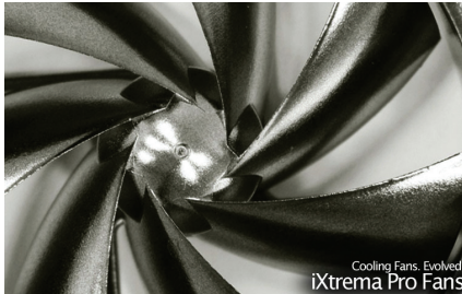
Cooling Fans Evolved. iXtrema Pro Fans